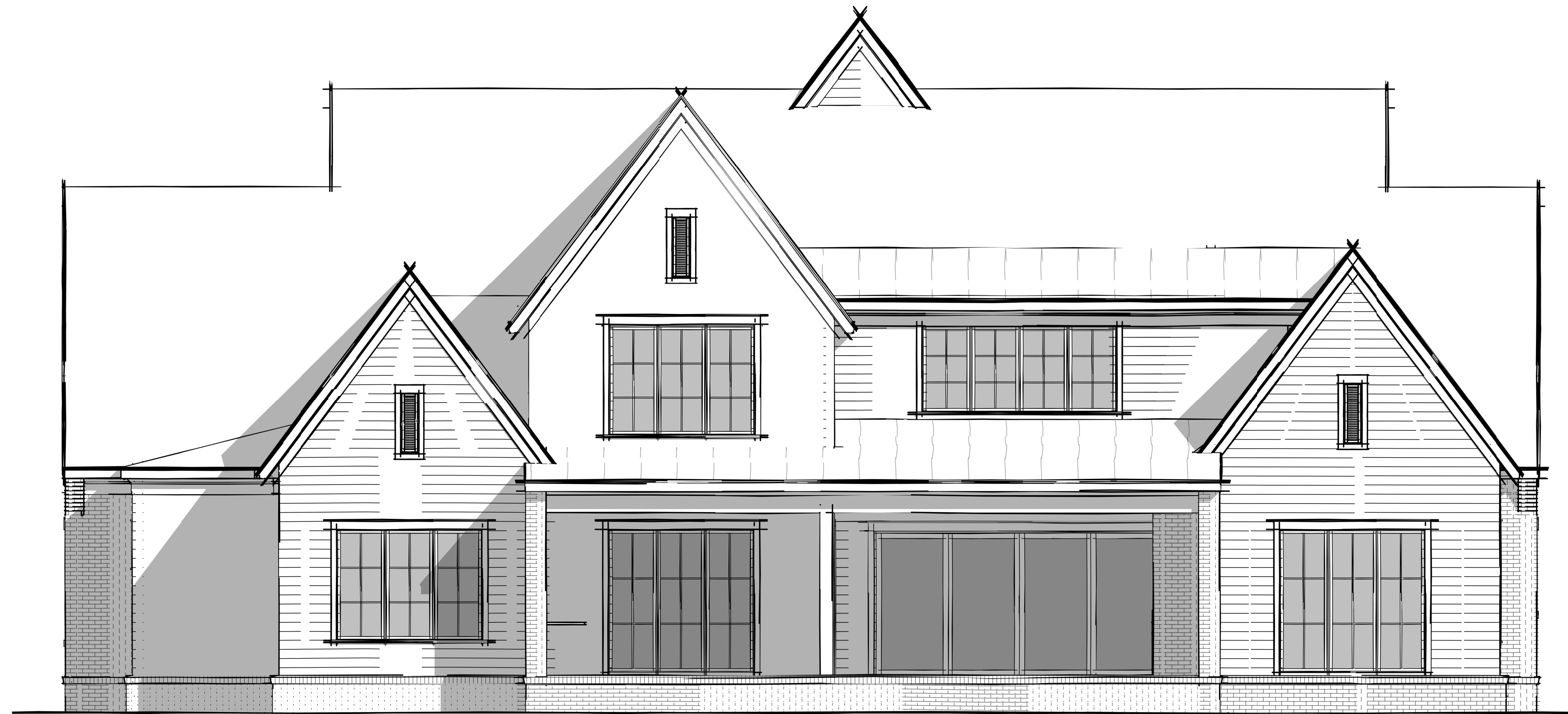
REAR ELEVATION 1/4" = 1'-0"