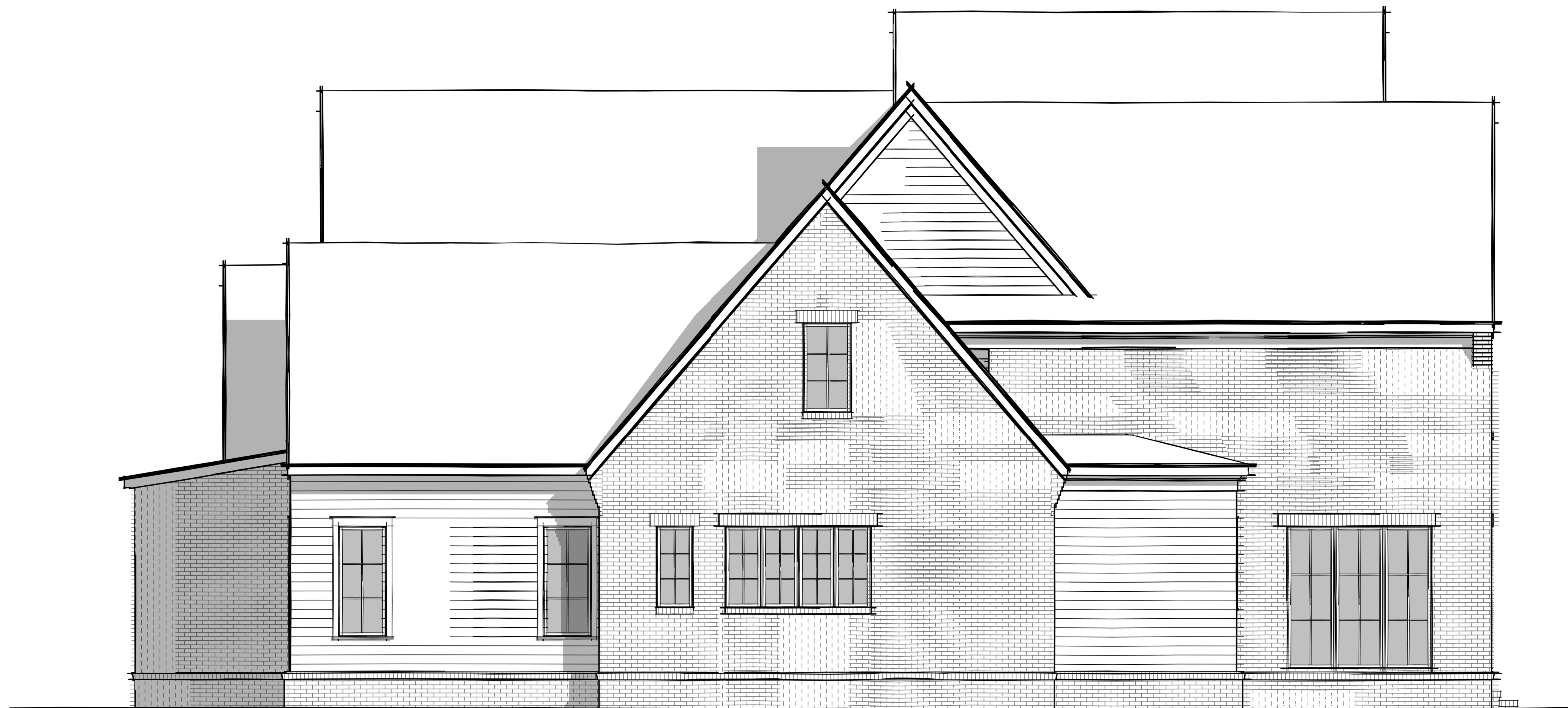
LEFT ELEVATION 1/4" = 1'-0"