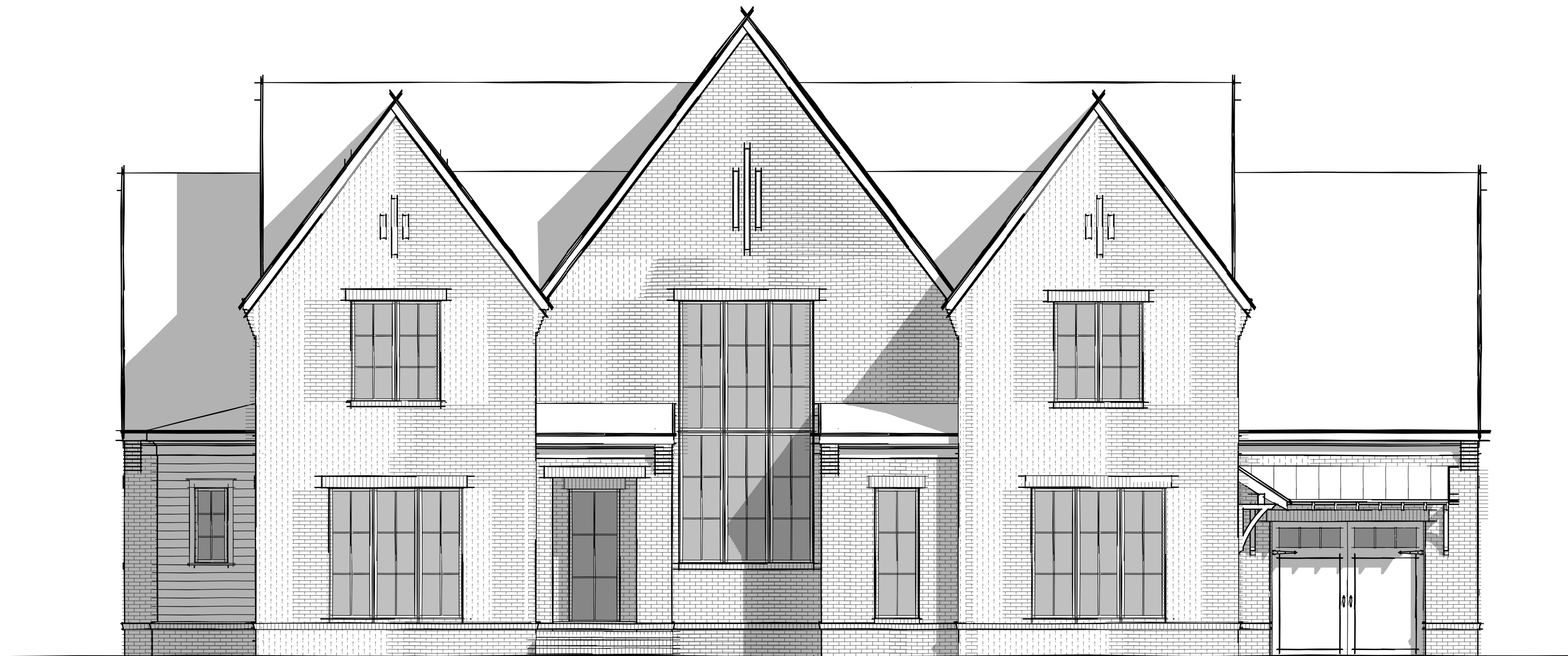
FRONT ELEVATION 1/4" = 1'-0"