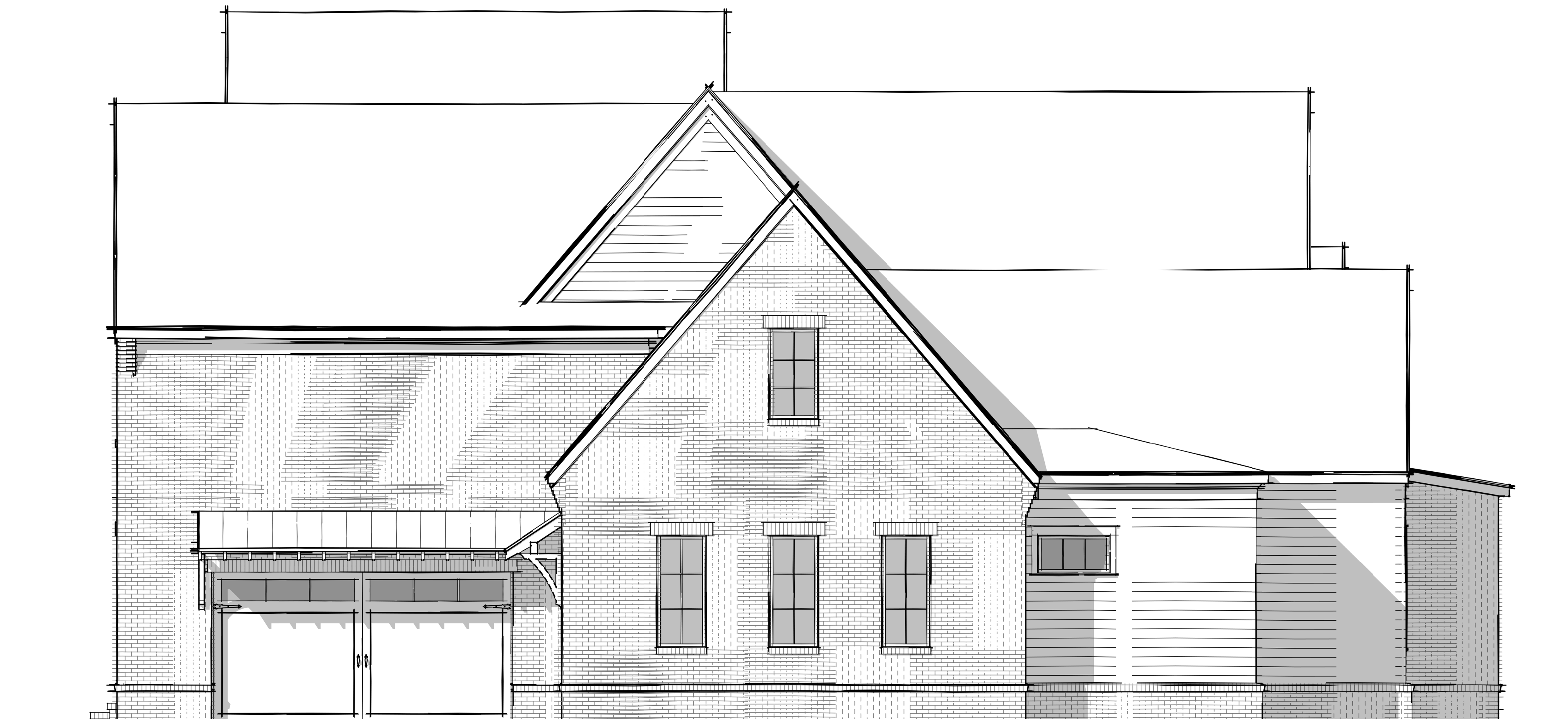
RIGHT ELEVATION 1/4" = 1'-0"